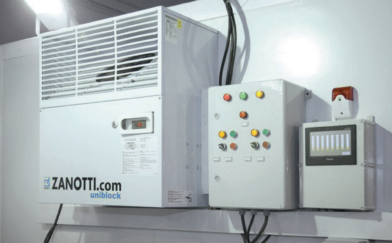
Example of installation of Zanotti's monoblocks (rental cold rooms)