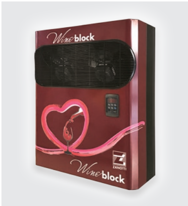
Zanotti's monoblock designed for wine cellars