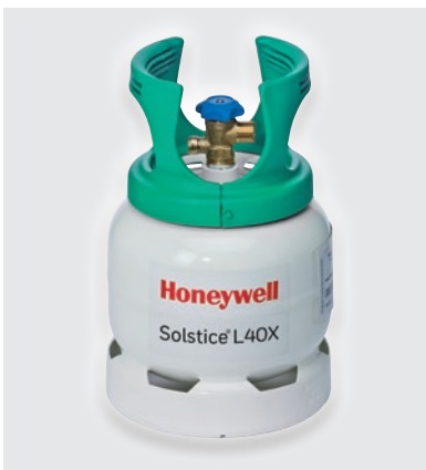
Solstice L40X (R-455A)

As a result of successful testing of L40X, Zanotti is considering the introduction of the refrigerant into their medium temperature monoblock systems and investigating opportunities in low-temperature applications as well as in transportation refrigeration.