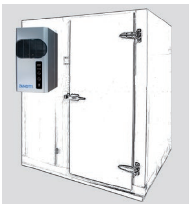
Zanotti GM series