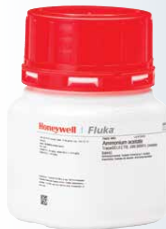
Honeywell Fluka - Ammonium Acetate TraceSELECT 73432-100G

For more information, visit: lab-honeywell.com/traceselect