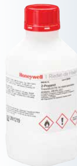
Honeywell Riedel de Haën - 2-Propanol TraceSELECT 04516-1L

Performing a speciation analysis in a complex mixture involves separation, identification, and characterization of various forms of elements in the sample. The most commonly used strategy for speciation analysis is to perform a separation step before a generic detector.