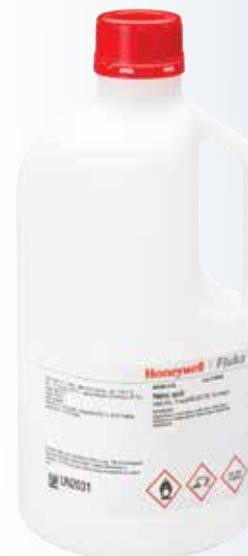
Honeywell Fluka - Nitric Acid TraceSELECT 84385-2.5L

The reduction of metals into mercury is more favourable than reduction to the solid-state electrode. Further on there is always a clean new Hg electrode surface available for each measurement.