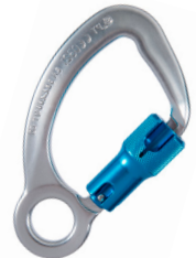
Aluminum Captive-eye Carabiner 0.86 in. (22 mm) Gate Opening