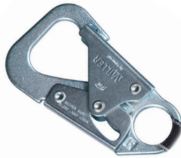
Miller 5K® Snap Hook 0.87 in (22 mm) Gate Opening