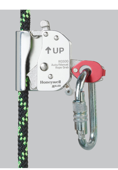
RG500 Auto/Manual Rope Grab, Ø12 mm without Lanyard Extension