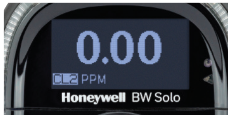
Easy to read