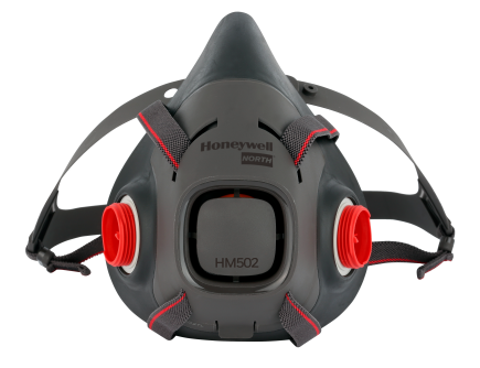
HM502, drop-down version