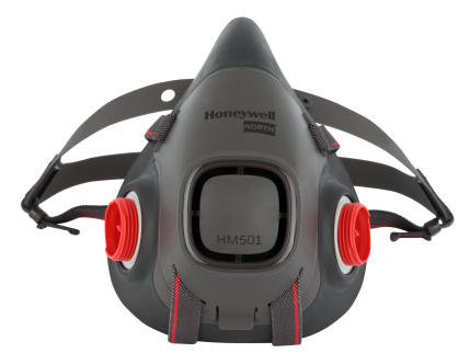
HM501, non-drop-down version