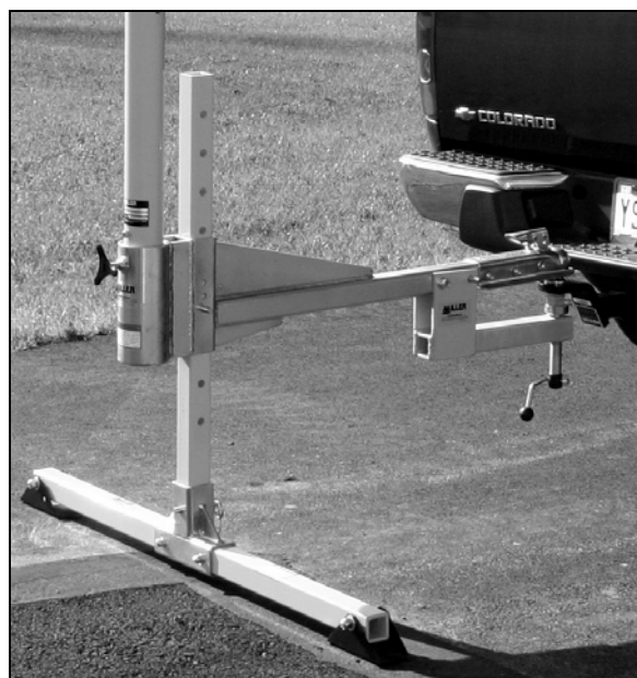
DH-16 attached to DH-12