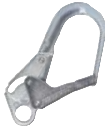
Steel Rebar Hook 2 1/2 in. (63.5 mm) Gate Opening