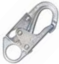
Steel Snap Hook 3/4 in. (19.1 mm) Gate Opening