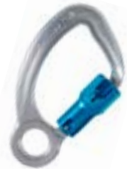
Aluminum Captive-eye Carabiner 0.86 in. (22 mm) Gate Opening