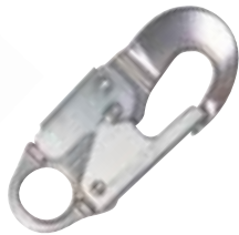
Aluminum Snap Hook 3/4 in. (19.1 mm) Gate Opening