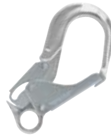
Aluminum Rebar Hook 2 1/2 in. (63.5 mm) Gate Opening