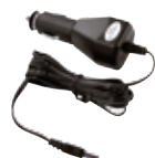
Vehicle Adaptor 12 V DC GA-V-CHRG4 Vehicle adaptor cable for base station power