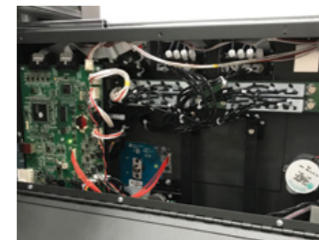
Step motor and encoder of Honeywell Vertex™ Edge

Unlike devices using capstans and chains, Honeywell Vertex™ Edge uses a geared step motor and encoder to advance the Chemcassette® tape smoothly through the system. That means you can have confidence that the gas concentration is measured accurately and stably for the life of each tape. The smooth advance also prolongs the life of the tape, preventing unexpected shortages.