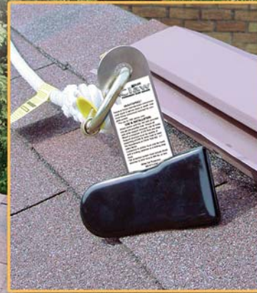
Exterior rooftop application