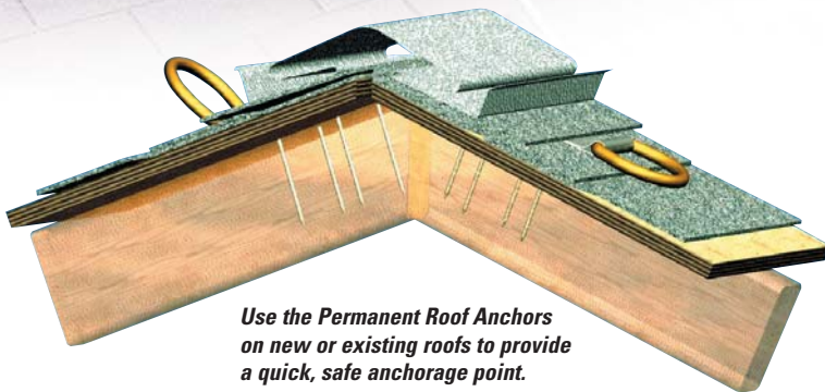
Use the Permanent Roof Anchors on new or existing roofs to provide a quick, safe anchorage point.