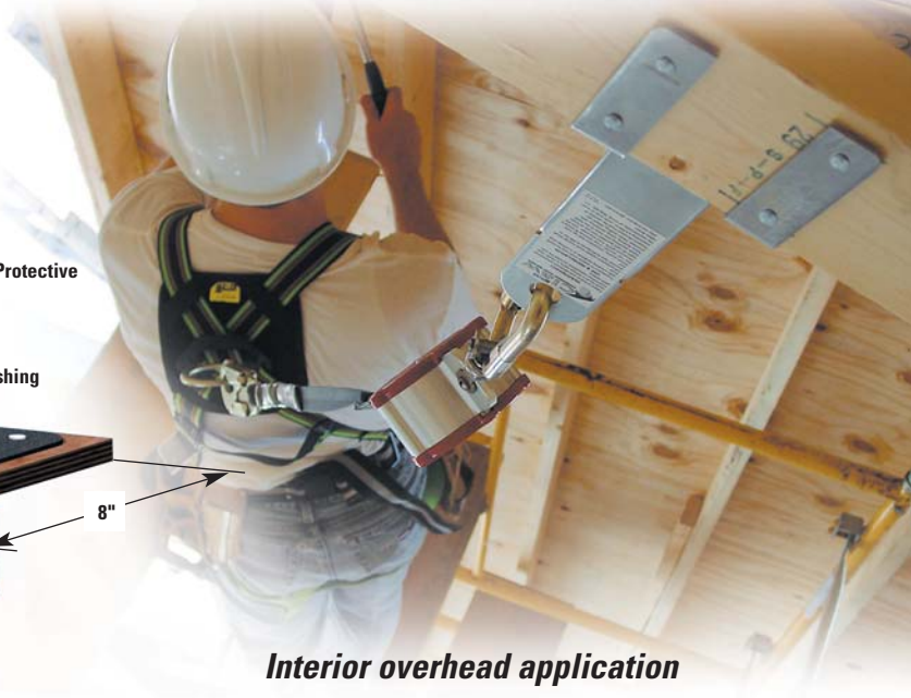
Interior overhead application

This equipment should only be used after reading the manufacturer's instructions. Failure to follow instructions could result in serious injury or fatality.