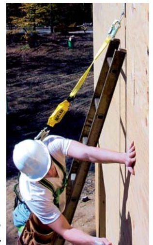
Single D Roof Anchors can also be used for vertical wall applications.