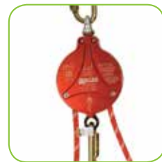
Backup Braking System included in Premium Kit

Best choice for users whose job does not normally include rescue