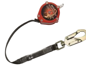
Miller Scorpion Personal Fall Limiter PFL-15/9FT