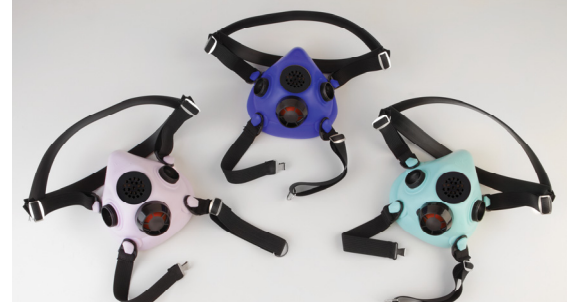
North RU8500, shown in lilac, royal blue, and light green with standard industrial exhalation valve cover.