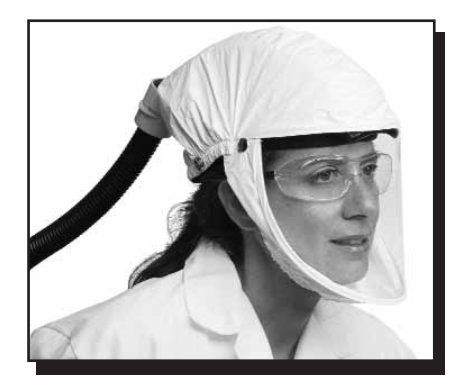
CA101 with PA101