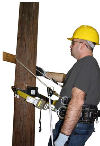
Miller Adjustable Rope Lanyard shown with the Miller StopFall™ Fall Restraint System

Meets OSHA 1926.502, 1910.66; ANSI A10.32, ANSI Z359.3-2007 and CSA Z259.11 class F requirements