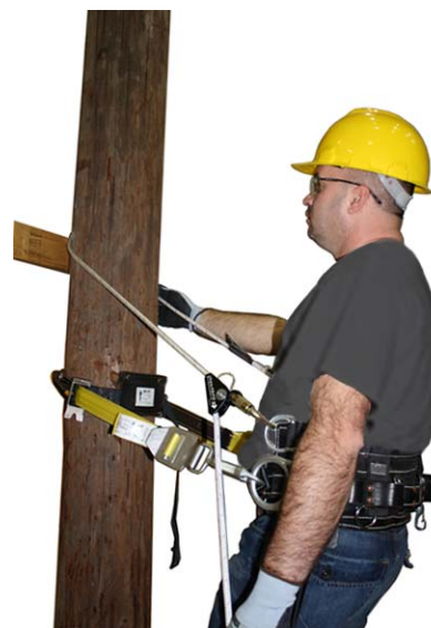
Miller Adjustable Rope Lanyard shown with the Miller StopFall™ Fall Restraint System

Meets OSHA 1926.502, 1910.66; ANSI A10.32, ANSI Z359.3-2007 and CSA Z259.11 class F requirements