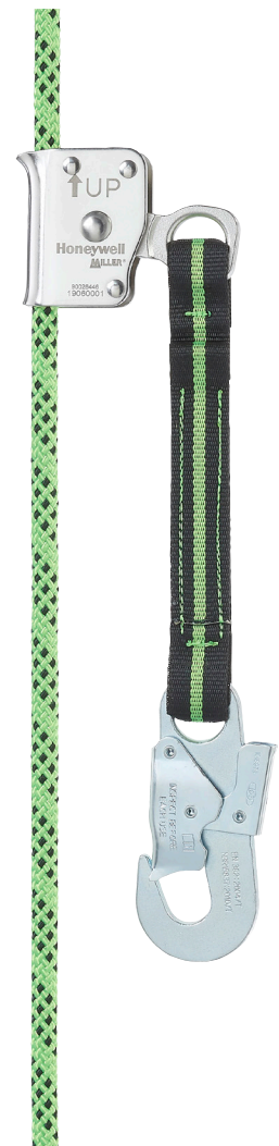
RG300 Automatic Rope Grab, Ø11 mm with Anchorage 5 M