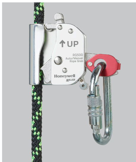
RG500 Auto/Manual Rope Grab, Ø12 mm without Lanyard Extension