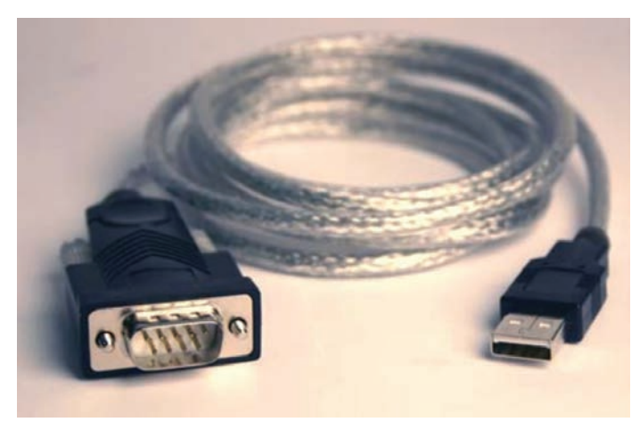
Figure 1. USB to Serial adapter

Many of today's computers do not have dedicated serial ports that allow users to connect external devices. Instead, many computer manufactures have opted to include additional USB ports. By using a USB-to-serial adapter, it is possible to attach a serial port device to an available USB port on your computer. All RAE Systems monitors with datalogging capability and RAELink wireless modems require a serial port interface. When using an adapter, the USB to Serial interface is transparent to all RAE equipment and requires no firmware changes. In addition, USB ports offer advantages such as plug-and-play and hot swappability.