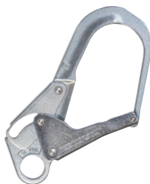
Steel Rebar Hook 2 1/2 in. (63.5 mm) Gate Opening