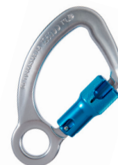
Aluminum Captive-eye Carabiner .86 in. (22 mm) Gate Opening

Limitless Possibilities. Ask the Expert. Technical Service: 800.873.5242 www.millerfallprotection.com