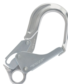
Aluminum Rebar Hook 2 1/2 in. (63.5 mm) Gate Opening