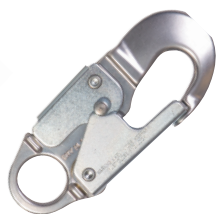
Aluminum Snap Hook 3/4 in. (19.1 mm) Gate Opening