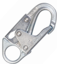
Steel Snap Hook 3/4 in. (19.1 mm) Gate Opening