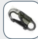
Locking Snap Hook 3/4-in. (19.1 mm) Gate Opening