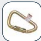
Steel Twist-Lock Carabiner 1-in. (25.4 mm) Gate Opening