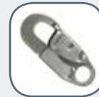
ANSI Z359 Locking Snap Hook 3/4-in. (19.1 mm) Gate Opening