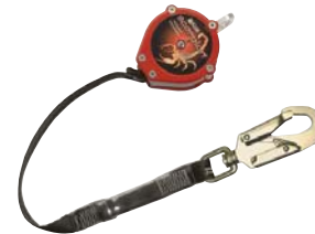
Miller Scorpion Personal Fall Limiter PFL-15/9FT