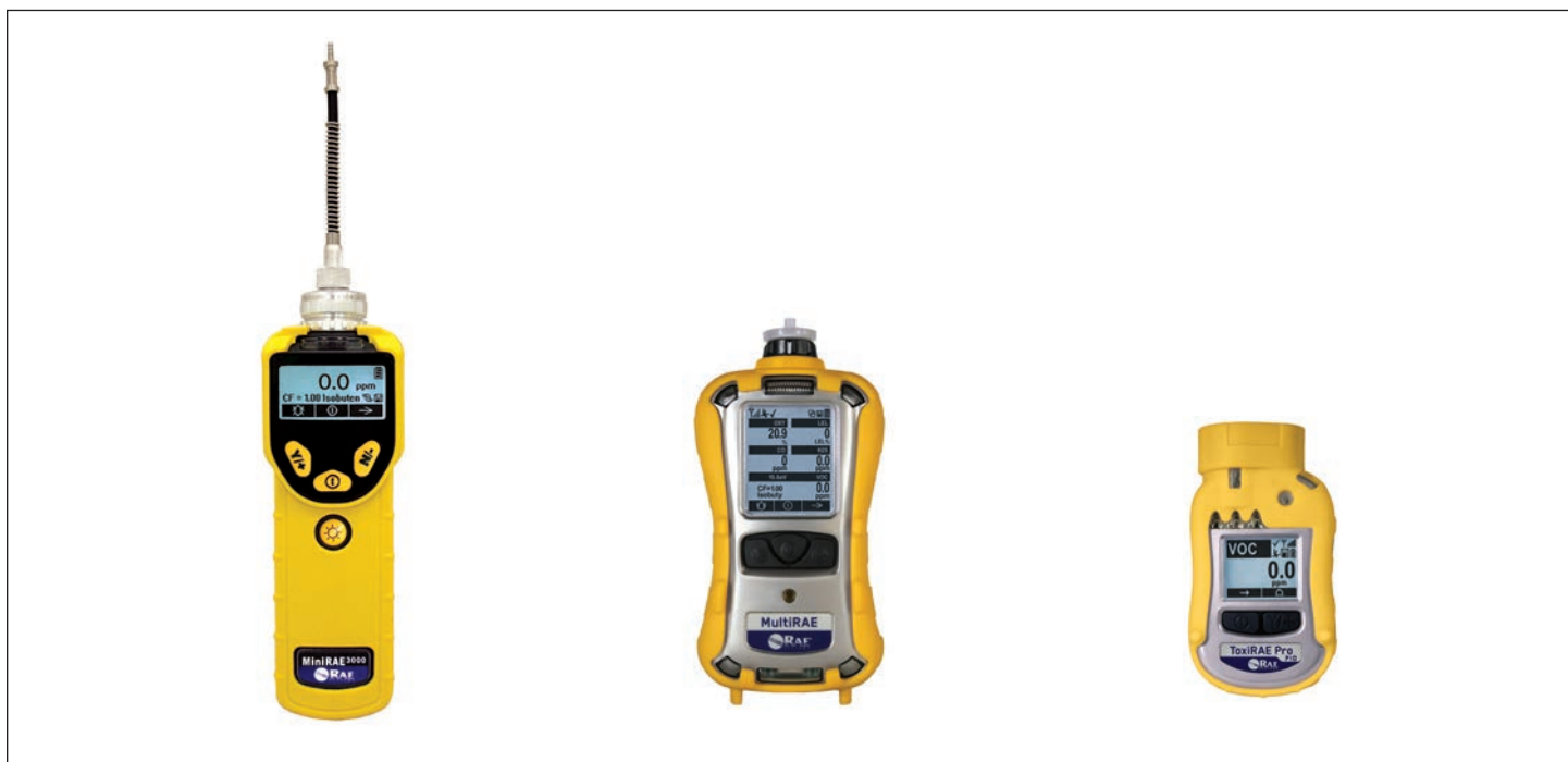
MiniRAE 3000, MultiRAE, and ToxiRAE Pro PID: Three RAE Systems instruments with PIDs.

The creation of a TWA value by AIHA for PGMEA is a new standard. RAE products are ready with pre-programmed correction factors, documentation, and technical staff to support your monitoring needs.