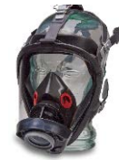
Facepiece with 5-Pt. Strap