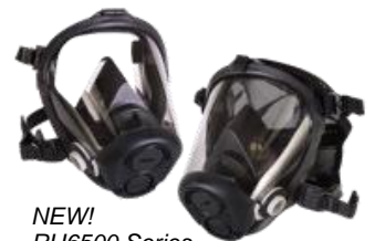
NEW! RU6500 Series