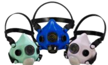
NEW! RU8500 Series