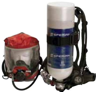
Survivair Puma™ SCBA