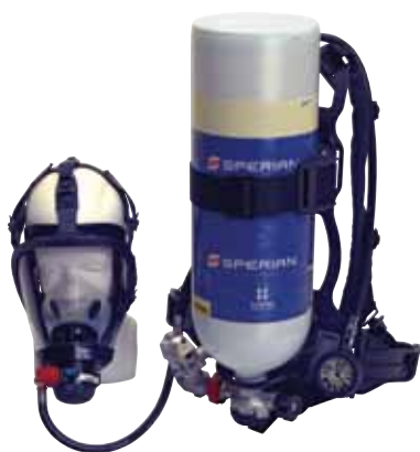
Survivair Cougar SCBA

Honeywell offers pre-configured and stocked SCBAs for ease of ordering. Honeywell SCBAs may also be custom configured to fit your application and needs.