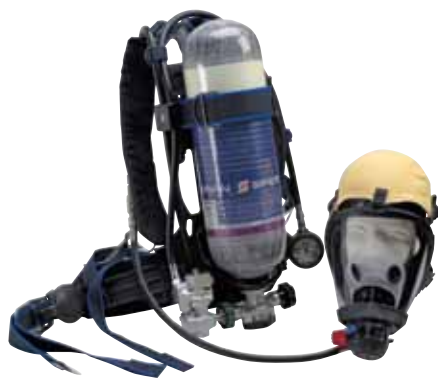
Survivair Panther (1997 Style) SCBA