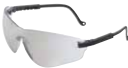
SCT-Reflect 50 — Light mirror coating is ideal for varying light conditions