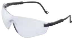
Clear — Ideal for most indoor work applications