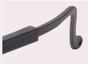
Adjustable temple lengths ensure a proper and comfortable fit.