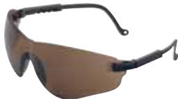
Espresso — Minimizes strong outdoor sunlight and glare