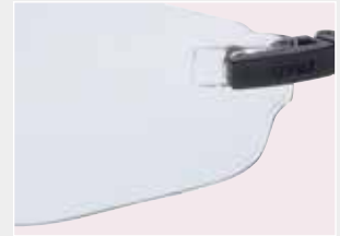
Dual nine-base and "optically perfected" wrap-around lens with integrated side shields provides workers with a clear and unobstructed field of vision.