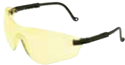
Amber — Ideal for low-light applications where enhanced contrast is needed