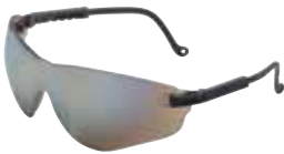
Gold Mirror — Deflects sunlight and glare