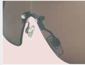
Adjustable nose piece reduces slippage and provides a personalized, comfortable fit.