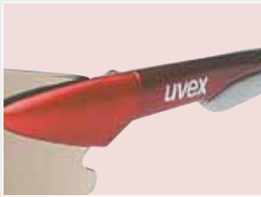
Bold temple design delivers attention-getting style.