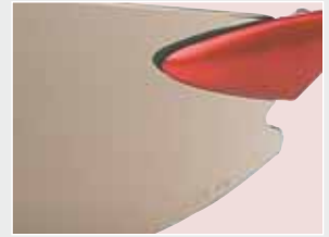
Nine-base, wrap-around lens design provides close-to-the-face protection and superior coverage.