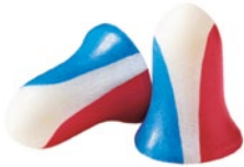
Max® USA Patriotic red, white, and blue colors

NRR 30 MAX-1S MAX-30S CAN A(L) uncorded corded