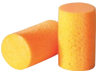
FirmFit® Firm foam reinvented

NRR 32 XTR-1 XTR-30 CAN A(L) uncorded corded