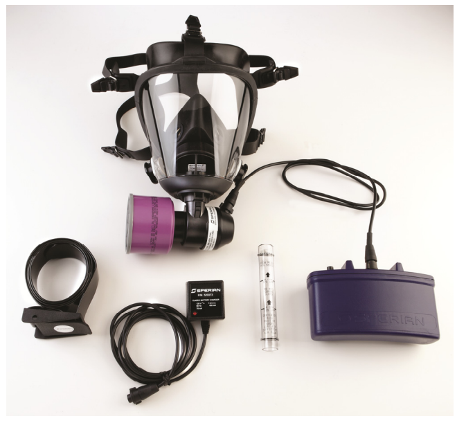
PR500 Series Face-Mounted PAPR

The PR500 Series Face-Mounted PAPR is recommended for respiratory protection against dusts, fumes and mists, particulate radionuclides, radon progeny attached to dusts, fumes and mists.