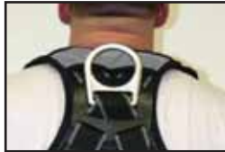
Stand-up D-Ring Assembly: Steel, Stainless Steel, Santoprene and Polyethylene Blend, Nylon