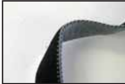
TechWeb: Polyester, Nylon