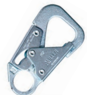
Miller 5K® Steel Snap Hook 0.87" (22 mm) Gate Opening