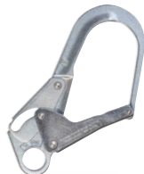
Steel Rebar Hook 2-1/2" (63.5 mm) Gate Opening