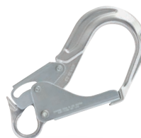
Aluminum Rebar Hook 2-1/2" (63.5 mm) Gate Opening