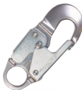
Aluminum Snap Hook 3/4" (19.1 mm) Gate Opening