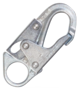
Steel Snap Hook 3/4" (19.1 mm) Gate Opening