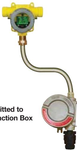
Sensor Fitted to Remote Junction Box

Sensepoint XCD RTD from Honeywell Analytics makes it easy on your maintenance team, time and budget when faced with the challenge of monitoring toxic gases in Class I, Div. 2 areas.