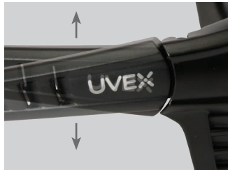
Temple and ratchet