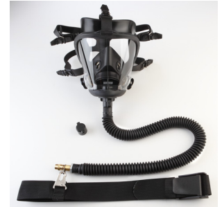
CF4001 CF-SAR Configuration

With the cartridge connectors capped with screw caps and the breathing tube connected, a continuous flow of air is supplied to the facepiece when the respirator is connected to an external air source.