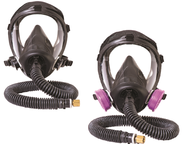
CF4001 – CF-SAR Configuration (left) & CF4002 – CF-SAR/APR Configuration