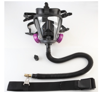
CF4002 CF-SAR Configuration

When the breathing tube is disconnected from the air supply hose, a check valve in the breathing tube assembly prevents leakage of contaminated air through the facepiece breathing tube and the wearer's air is drawn through the cartridges and/or filters. This feature allows for safe entry, exit, movement from one air supply to another, or escape from an area in case of air supply failure.