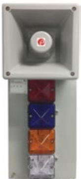
FA300 Alarm Bar