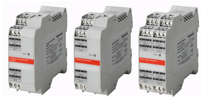
Analogue Input Module, Digital Input Module and Relay Output Module

Touchpoint Pro uses a simple 'building block' approach which provides unrivalled flexibility. The simple plug-in Input / Output (I/O) Module, one of four key building blocks that form the Touchpoint Pro system, allows for easy expansion.