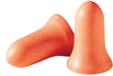
Max Small ® Comfort for smaller ear canals

NRR 30 LPF-1 LPF-30 CAN A(L) uncorded corded