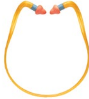
QB2® HYG Supra-aural protection