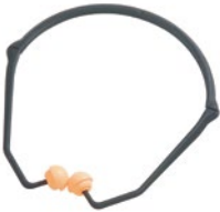
PerCap® Folding semi-aural protection