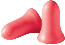
Max® Highest NRR in disposable

An economical and convenient choice for work situations that demand a high degree of comfort, or where hygiene presents a problem for reuse. Formable foam is also THE material of choice when highest attenuation is required.