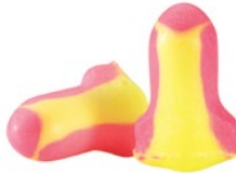
Laser Lite® Highly visible protection

NRR 33 MAX1-USA MAX30-USA CAN A(L) uncorded corded