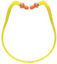
QB1® HYG Inner-aural protection

An alternative for those who work in intermittent noise or for managers and visitors who move in and out of noisy areas.