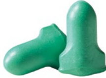
Max Lite® Low pressure foam for comfort

NRR 33 MAX-1 MAX-30 CAN A(L) uncorded corded