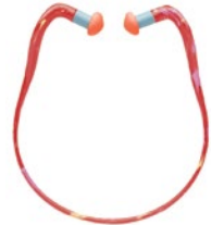
QB3® HYG Semi-aural protection