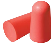
X-TREME® Tapered design for comfort

NRR 32 LL-1 LL-30 CAN A(L) uncorded corded