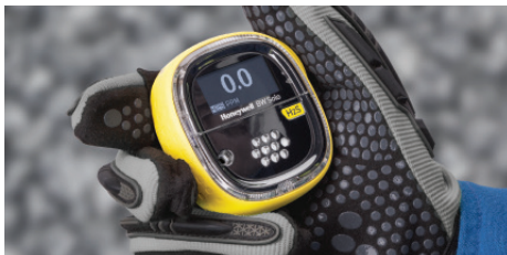
Easy to handle