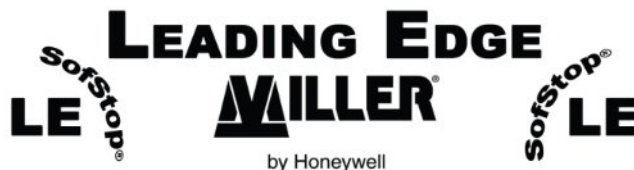
Figure 1: Energy-absorber information indicating the MightyLite LE is for leading edge applications.

A6: The MightyLite LE has an energy-absorber integrated into the lifeline which increases safety in leading edge applications and eliminates the need for adding an energy-absorbing pack prior to working in a leading edge application. The pack has clear markings stating that it is for leading edge applications. See Figure 1. The back label of the SRL includes “Leading Edge Self-Retracting Lifeline” printed on the label. See Figure 2. Additionally, the variable label inset into the front label references that the product is a Leading Edge SRL.