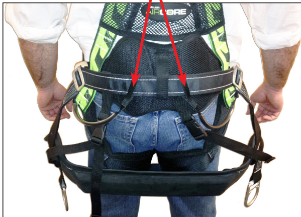
Tool Loops (shown attached to harness belt)