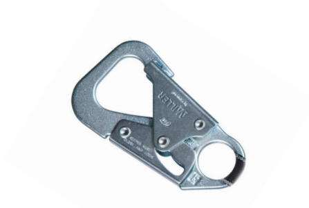
Miller 5K® Snap Hook 0.87 in (22 mm) Gate Opening

Limitless Possibilities. Ask the Expert. Technical Service: 800.873.5242 www.millerfallprotection.com