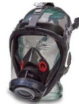
Facepiece with 5-Pt. Strap

See page 9 for additional facepiece sizes and facepiece part numbers with temple inserts.