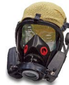
Facepiece with VAS and RCS