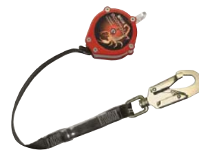
Miller Scorpion Personal Fall Limiter PFL-15/9FT