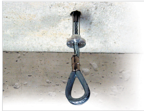
498 Grip Application

*All hardware meets ASTM (50) fifty-hour salt spray test requirements.