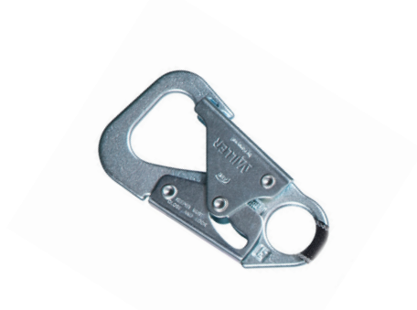
Miller 5K® Snap Hook 0.87 in (22 mm) Gate Opening