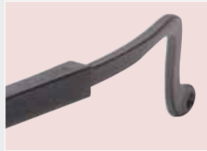
Adjustable temple lengths ensure a proper and comfortable fit.