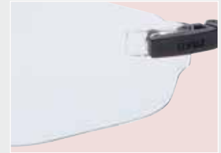
Dual nine-base and "optically perfected" wrap-around lens with integrated side shields provides workers with a clear and unobstructed field of vision.