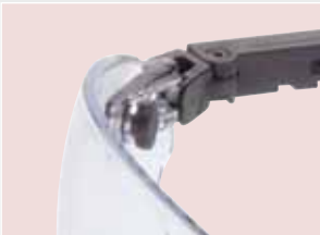
Patented lens inclination system for a customized fit.