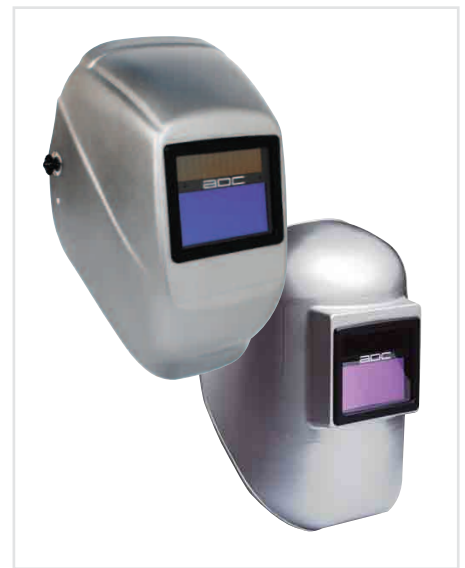
Tigerhood® Futura® with ADF: 2999BVADCSR (top) and Classic with ADF: 999BV913DS (bottom)