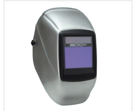
Tigerhood Futura® XXL with ADF: 2090XXLBV913SR

90x110mm ADC ADF Filter, Shades 9-13, Sensitivity and Delay Adjustment, Fits 2999, 999, FMX, 2090