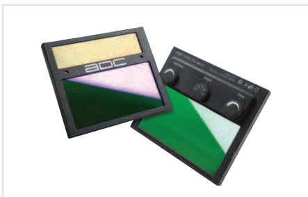
ADF Filter Lens: FMPBV913DSADC