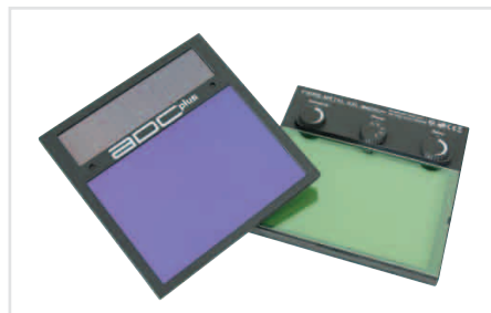
ADF Plus Filter Lens: FMXXLBV913